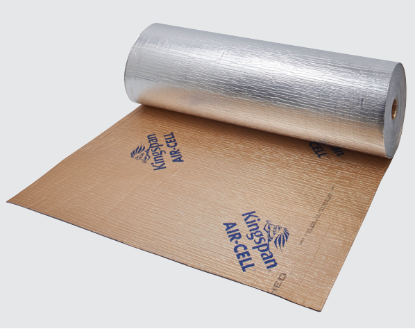
Figure 3. Kingspan AIR-CELL Insulshed® 50. Australian-made Kingspan AIR-CELL Insulshed® 50 is your solution for comfort in your shed, achieving indoor temperatures that are significantly cooler in summer and warmer in winter.

Kingspan AIR-CELL Insulshed® is manufactured with a patented closed-cell foam structure sandwiched by reflective foil surfaces, and is the fibre-free, non-allergenic alternative to conventional bulk insulation.