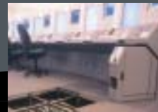
Raised Access Floors